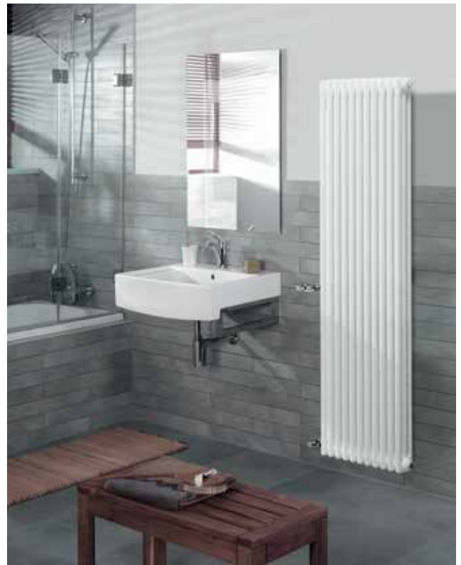
After: Zehnder Charleston – same heating pipes but with an attractive design. Zehnder Charleston blends perfectly into the interior.