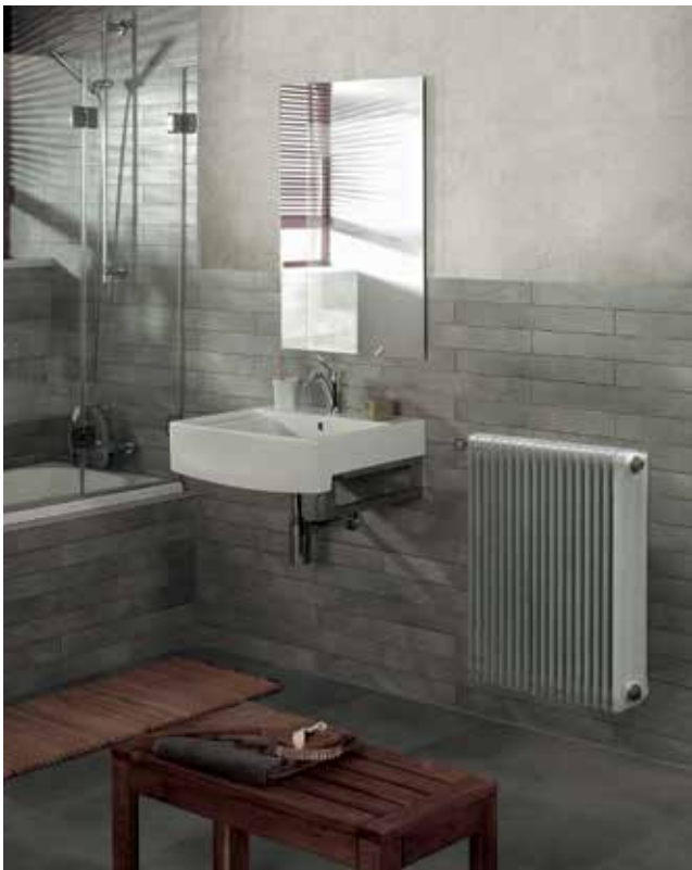
Before: DIN standard radiator